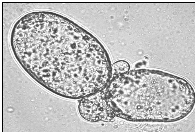
Fig.2. Bulbous mycelium of Caecomyces communis . Light microscopy of native preparation (x 400)

The rumen of reindeer represents a unique microbial ecosystem developed through a long evolution of exposure to Arctic flora and contains bacterial lineages not observed in other ruminants. The volatile fatty acids produced by microbial fermentation in the rumen, are the principal sources of dietary energy for the ruminant animal. When fed the same diet, the microbial composition and fermentation pattern in the rumen was found to differ between cows and reindeer. At the same time, reindeer produced less methane than non-lactating cows per kg of feed eaten but slightly more per unit of liveweight. The numbers of rumen methanogens have been reported to be lower in Svalbard reindeer compared to other domestic ruminants. This may represent a survival mechanism to lower energy losses during fermentation in the rumen and thereby increase the amount of energy from the diet to support maintenance and growth in these species.